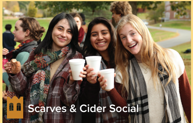
Scarves & Cider Social