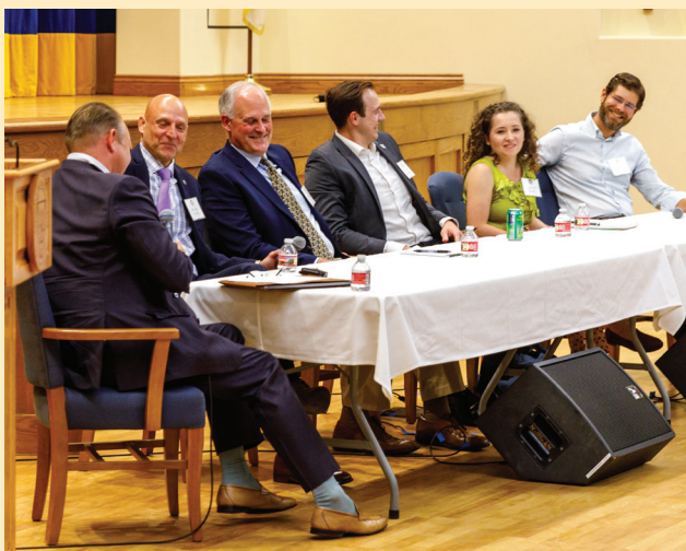
Career Day Panel in California

In their sophomore and junior years, students at the College learn how Galileo and Newton overturned the popular notion that the sun orbits the earth. In its own way, the Career Center has a similar goal: from big picture reflections that place work in a spiritual context to more focused considerations on leveraging their Catholic liberal education on job applications, it is overturning conventional wisdom, reminding students that their professional futures are bright not in spite, but because, of the time they spend seeking the truth for its own sake.