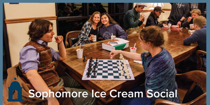
Sophomore Ice Cream Social