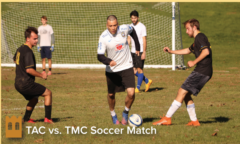
TAC vs. TMC Soccer Match