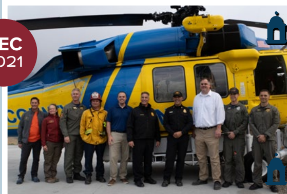
College collaborates with regional firefighter and search and rescue teams to build new heliport on campus