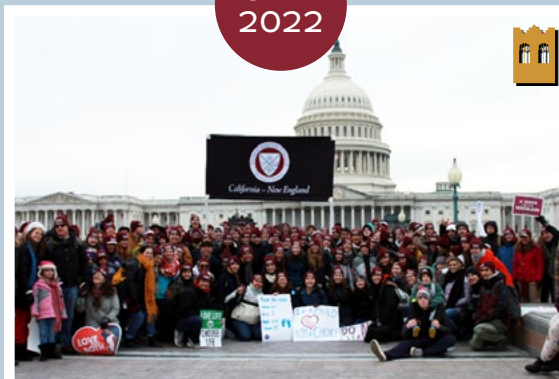
Entire New England student body takes part in March for Life in Washington, D.C., while California students help lead the Walk for Life West Coast