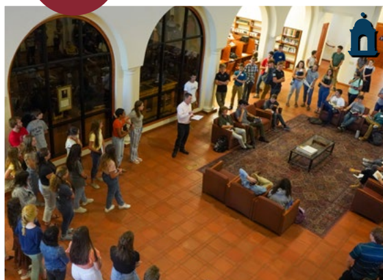
High School Summer Programs are held on both campuses for more than 170 rising seniors