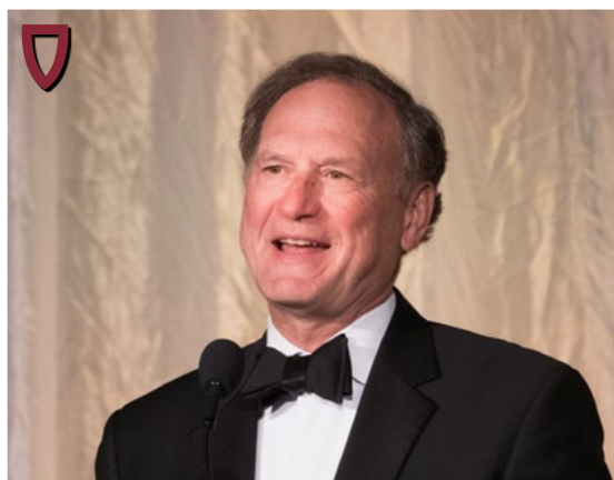
U.S. Supreme Court Justice Samuel Alito gives the Keynote Address at the 50 th Anniversary Gala and visits the campus the following day for a Town Hall with students