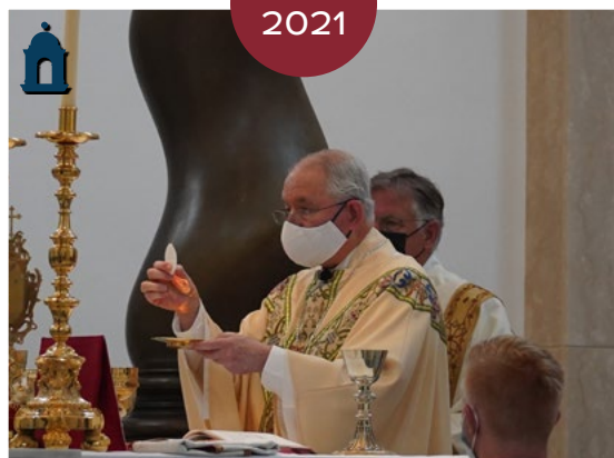
The Most Rev. José Gomez, Archbishop of Los Angeles, offers 50 th Anniversary Mass of Thanksgiving