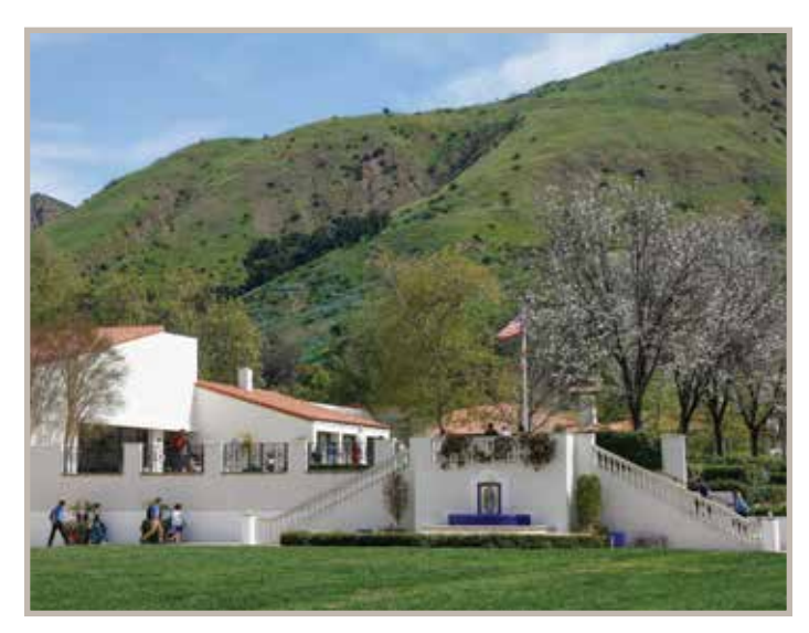
After years of drought, Southern California was blessed with ample rain this winter, resulting in bright green hillsides dotted with wildflowers.