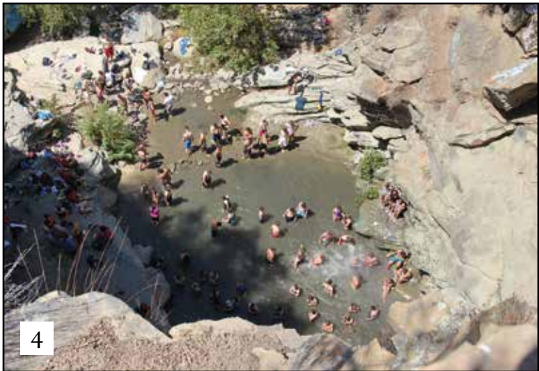
Scenes from the 2013 Great Books Program for High School Students: 1. Students enjoy dinner during a trip to Santa Barbara. 2. A day at Rincon Beach 3. Volleyball on the campus athletic fields 4. Students take a dip after hiking to the “Punch Bowls” in the neighboring Los Padres National Forest 5. A trip to the Getty Museum in Los Angeles 6. Discussing the great books 7. Open-mic night in St. Joseph Commons