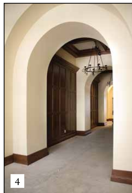
1-2. A construction crew grades the site of St. Gladys Hall, adjacent to Our Lady of the Most Holy Trinity Chapel. 3. A renovated classroom in St. Augustine Hall, with lowered ceilings and new moldings 4. The newly arched corridor of St. Augustine, with mahogany wainscoting and wrought-iron chandeliers