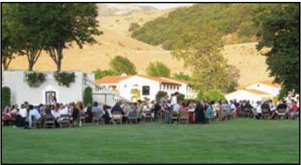
Alumni enjoy dinner on the academic quadrangle by the Guadalupe Fountain.